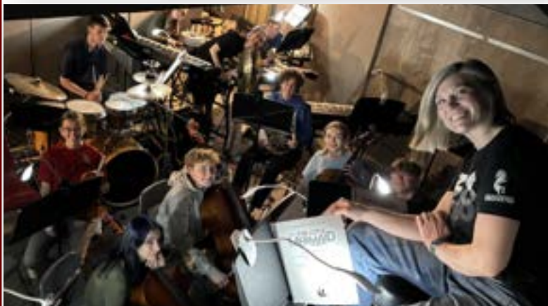
Pit orchestra rehearsal