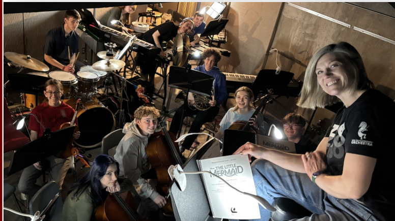
Pit orchestra rehearsal