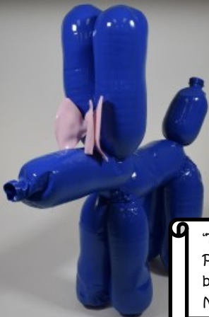
"Recycled Puppy" Plastic water bottles - Kuria McGohan