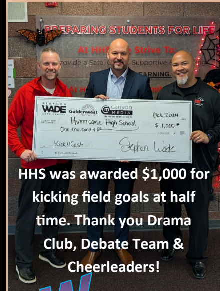
HHS was awarded $1,000 for kicking field goals at half time. Thank you Drama Club, Debate Team & Cheerleaders!